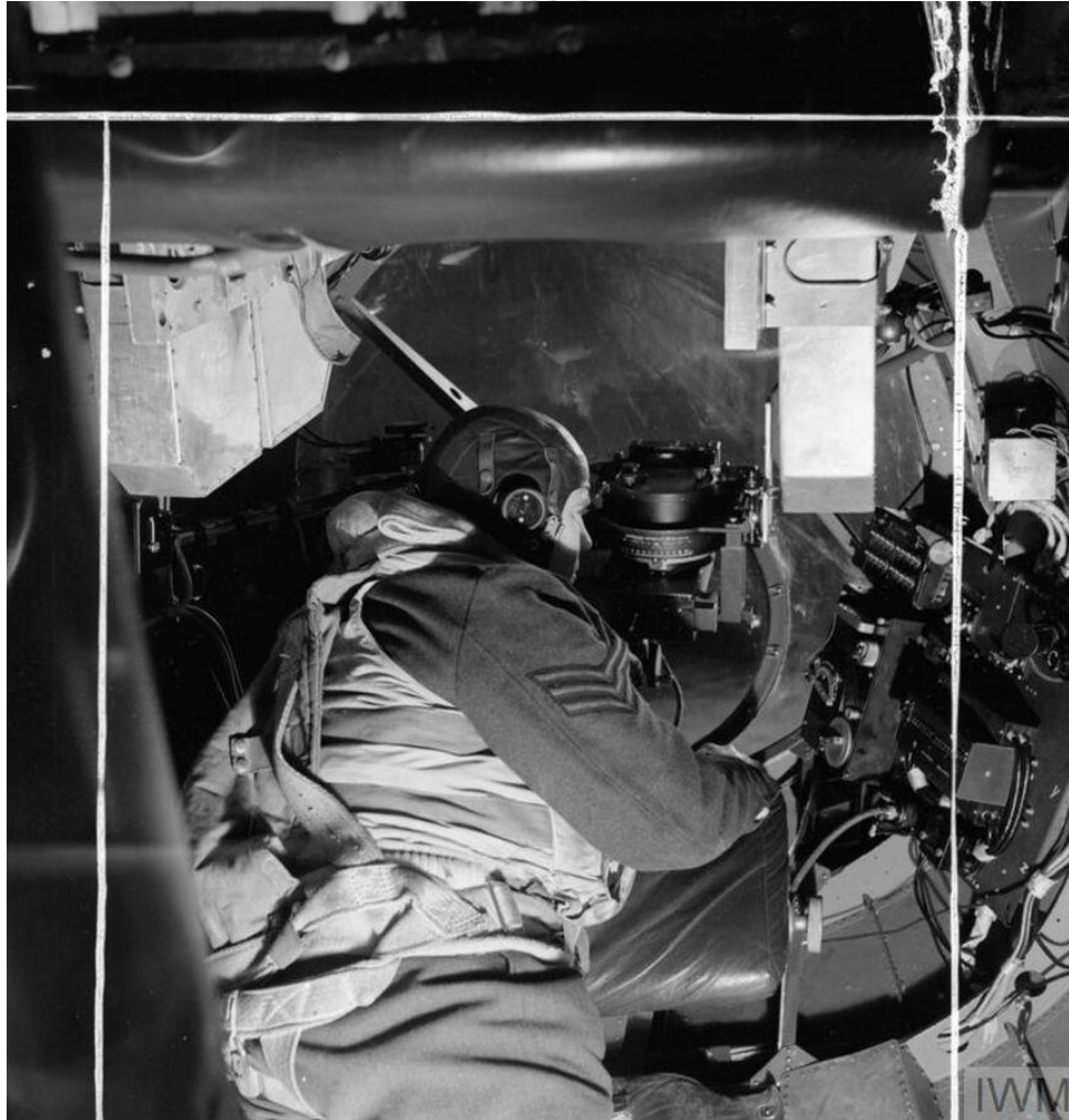
The bomb aimer in an Avro Lancaster, checking over the instruments in his position before takeoff from Scampton, Lincolnshire. Imperial War Museum. Image: IWM (CH 9129)